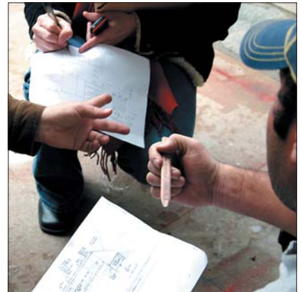
Tier 2 arrangements reflect the presence of organizations and response capabilities that can be called upon cooperatively.

The boundary between a Tier 2 and Tier 3 scenario is also dependent on the accessibility to Tier 3 resources. In areas where this is restricted, emphasis needs to be given to ensuring an appropriate Tier 2 capability is in place prior to any Tier 3 support arriving.