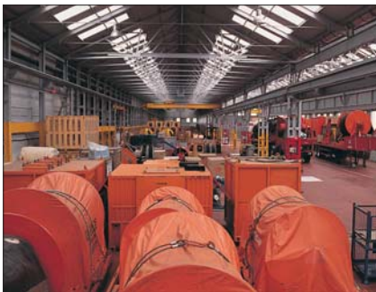
Major stockpiles of equipment remain a key feature of Tier 3 resources.

The oil industry has also invested in a number of other major stockpiles, some of which may be used internationally. One example is the Marine Spill Response Corporation (MSRC), which has substantial resources distributed at strategic locations around the USA. Another such example is a network of centres strategically located throughout Brazil—Environmental Defence Centres (CDA)—for national response and international support across South America. Such response providers are commonly now part of a global response network offering coordinated support and assistance with international Tier 3 Response Centres and other organizations of similar status to themselves.