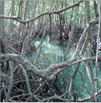
The design of tiered capabilities is influenced by a range of factors including the setting and operational activity.