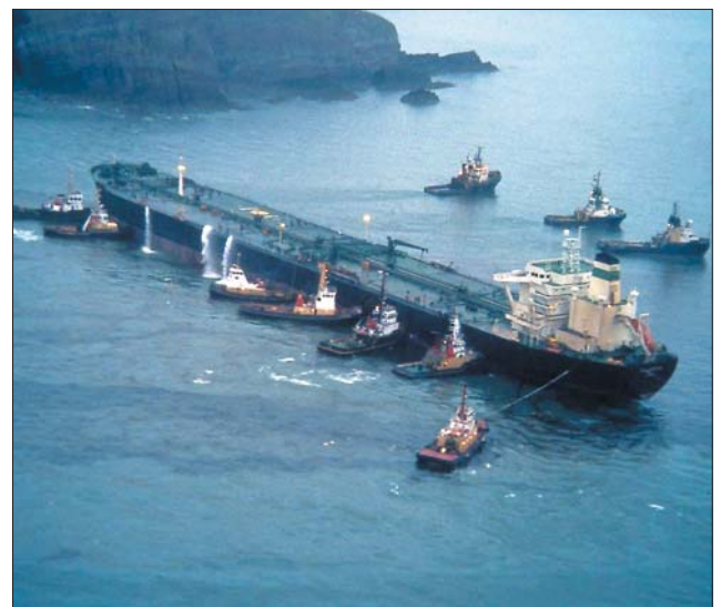
Tier 3 spills, due to their scale and likely major impacts, need substantial response resources from national and/or international sources.