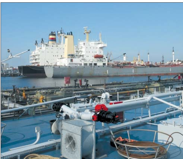
Tier 1 spills are generally small in size, affect only a local area and may be dealt with by the individual operator.

The conventional definition of Tiered Preparedness and Response.