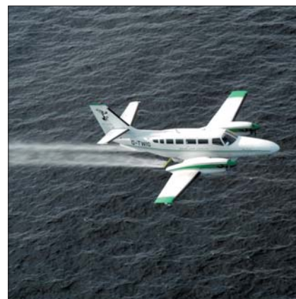
Aircraft dispersant capabilities may be provided for a rapid response.