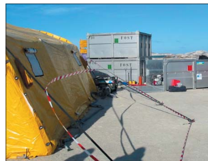
Tier 2 resources awaiting deployment at the scene of a spill.