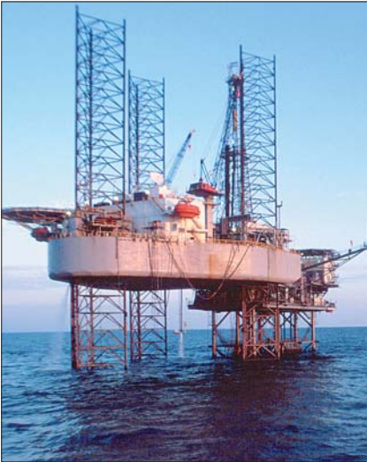
An offshore well blowout may involve an exceptionally large volume of spilled oil and could demand a Tier 3 response.

A Tier 3 oil spill event is broadly portrayed as one where all available local and additional Tier 2 resources are not enough to respond effectively to the scenario. As with any scenario that goes beyond a Tier 1, commonly there will be an extensive range of sensitivities impacted and stakeholders involved. The conventional view of a Tier 3 scenario is one involving an exceptionally large volume of spilled oil, for example from a major ship-sourced accident, an offshore or inland well blowout, or other such rare but highly significant event. In reality, a Tier 3 response may also be required for more modest volumes, perhaps where Tier 2 arrangements may be largely absent or overwhelmed, highly sensitive areas threatened, or highly-specialized strategies being required that are not available locally. With the growth of oil production activities in increasingly remote and sensitive areas, the need for additional Tier 3 support has become greater than generally perceived in the past.